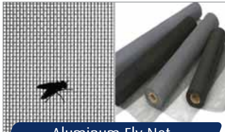
Aluminum Fly Net