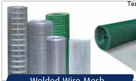
Welded Wire Mesh